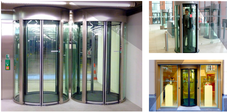
STANDARD CYLINDRICAL SECUREDOOR

It features digital voice communication to help guide users through the portal, and there's a control panel with an intercom system if needed. There is a DDA Cylindrical SecureDoor option if your facility requires it, as well as internal lighting for a more user-friendly experience without jeopardising the security of your facility.